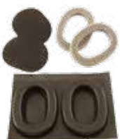
Hygiene kit High Attenuation line Art. No 6008000