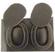
Hygiene kit Slim line Art. No 6007000

Storage: Before and after using ear-muffs store them in a clean dust-free place. After long-term use it is recommended to turn the ear cups outwards to allow the insulation foam to dry.